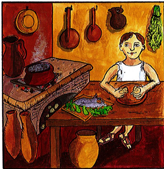
Horātia puella Rōmāna est; in casā cēnat.